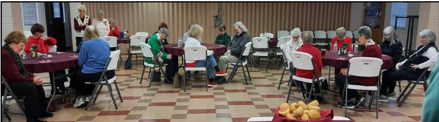
The ladies of the church and friends of the church gathered in fellowship Hall on December 8th for their annual Christmas Luncheon. After enjoying a wonderful lunch, they continued the time of fellowship with games and prizes. It was a great start to the Christmas season.